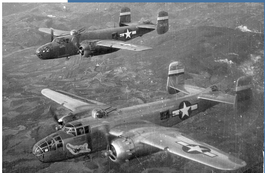
B-25 bombers soar over Italy