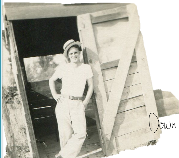
Down at the shack

These images are made available through a private family collection and will be transformed into a moving and evocative exhibit by accomplished museum educator, writer, and content developer Stephanie Lile.